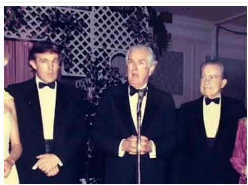
Roger Stone's friends Trump and Nixon.

Roger Stone is currently trying to promote his latest book.