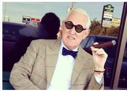
Roger Stone, the man who invented PizzaGate?