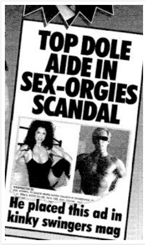
In 1996, Roger Stone was exposed.