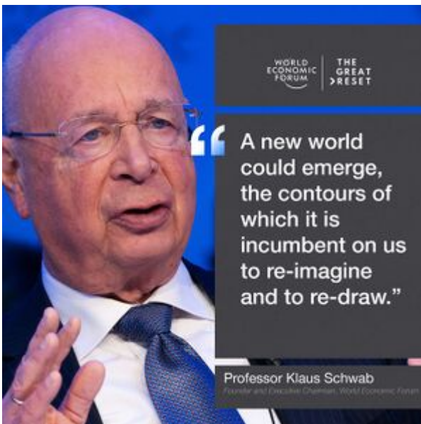
Klaus Schwab, ex-Bilderberg Steering Committee

The Great Reset is an SDS attempt to reframe of economic inequality in a positive light: "You'll own nothing, and you'll be happy". COVID-19 has greatly increased economic inequality as small and medium enterprise have been forced under while unprecedented peacetime increases in the money supply and corporate welfare have been doled out to a few large organisations.