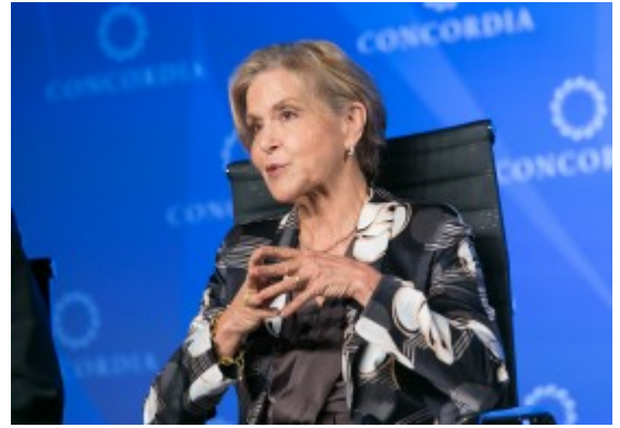
Judith Rodin took part in the 2010 Lock Step exercise about using a pandemic to usher in high tech totalitarianism

In Spring 2020, many nation states formed COVID-19 Task Forces , many of which had, or acted as if they had, " state of emergency " powers to override standard operating procedure .