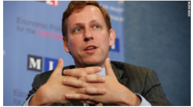
Peter Thiel, Co-founder and largest shareholder of Palantir, which is heavily involved in crunching COVID data

Jutta Urpilainen (3 February 2021) [111]