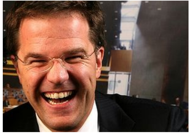
Mark Rutte, six time Bilderberg visitor, as Dutch PM fired his Economic Affairs Minister, Mona Keijzer, shortly after she publicly criticised the Dutch Vaccine passport. [152]