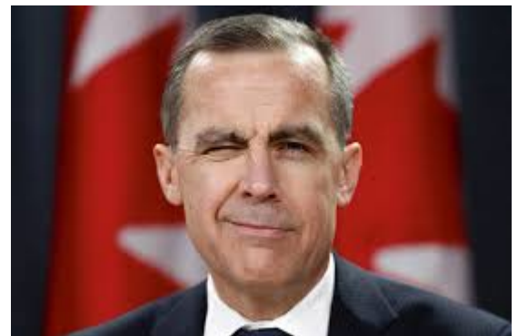
Mark Carney, Tri-national, quad-Bilderberger, Governor of the Bank of England until March 2020, when he became an "informal adviser" to Prime Minister Justin Trudeau