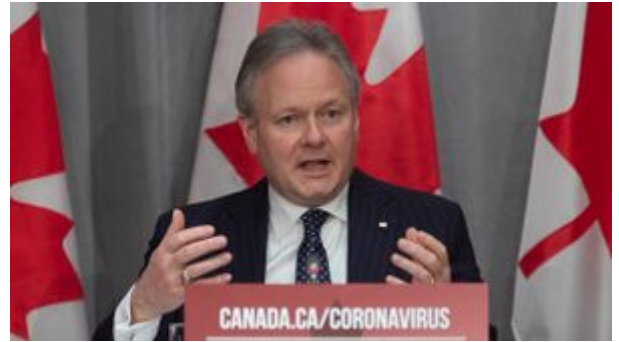
Stephen Poloz speaking in March 2020. [199]

France's Prime Minister Jean Castex chose the French Covid debt commission to "steer the nation's deliberations on the future of public finances in the aftermath of the pandemic." He is not known to have attended the Bilderberg, but 3 of his 10 commissioners have: [204]