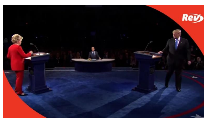
Rev > Blog > Transcripts > Classic Debate Transcripts > Donald Trump vs. Hillary Clinton 1st Presidential Debate Transcript 2016

Full transcript of the first presidential debate of the 2016 U.S. presidential race between Donald Trump and Hillary Clinton. It was moderated by Lester Holt of NBC, it took place on September 26, 2016, in Hempstead, New York.