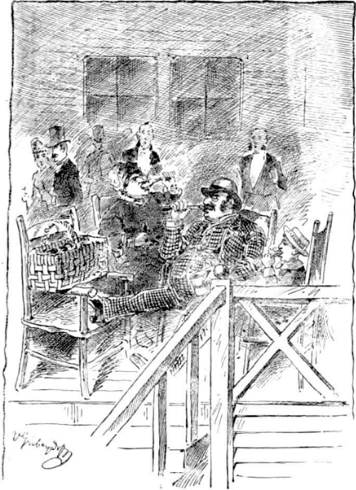
ON THE SUMMER-HOTEL VERANDA.