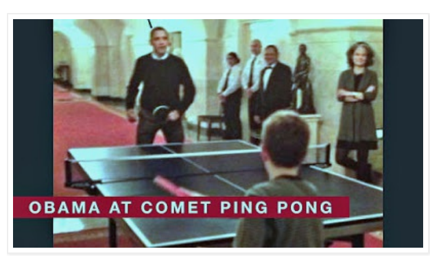
Obama at the White House. "Dissecting the #PizzaGate Conspiracy Theories".

The photo was actually taken in the White House.[2]