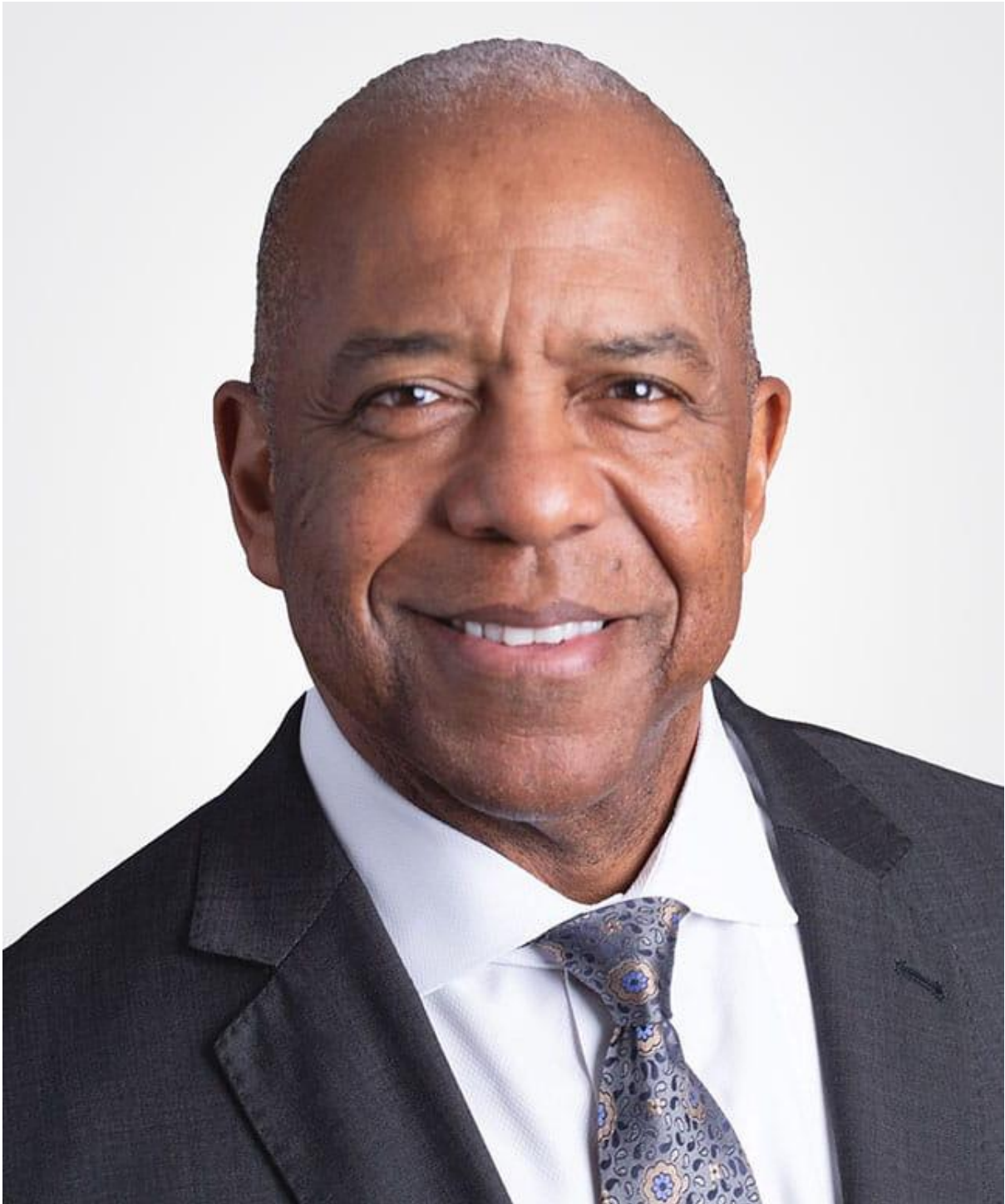
Bernard A. Harris Jr.

Chief Executive Officer and Managing Partner of Vesalius Ventures, Inc.