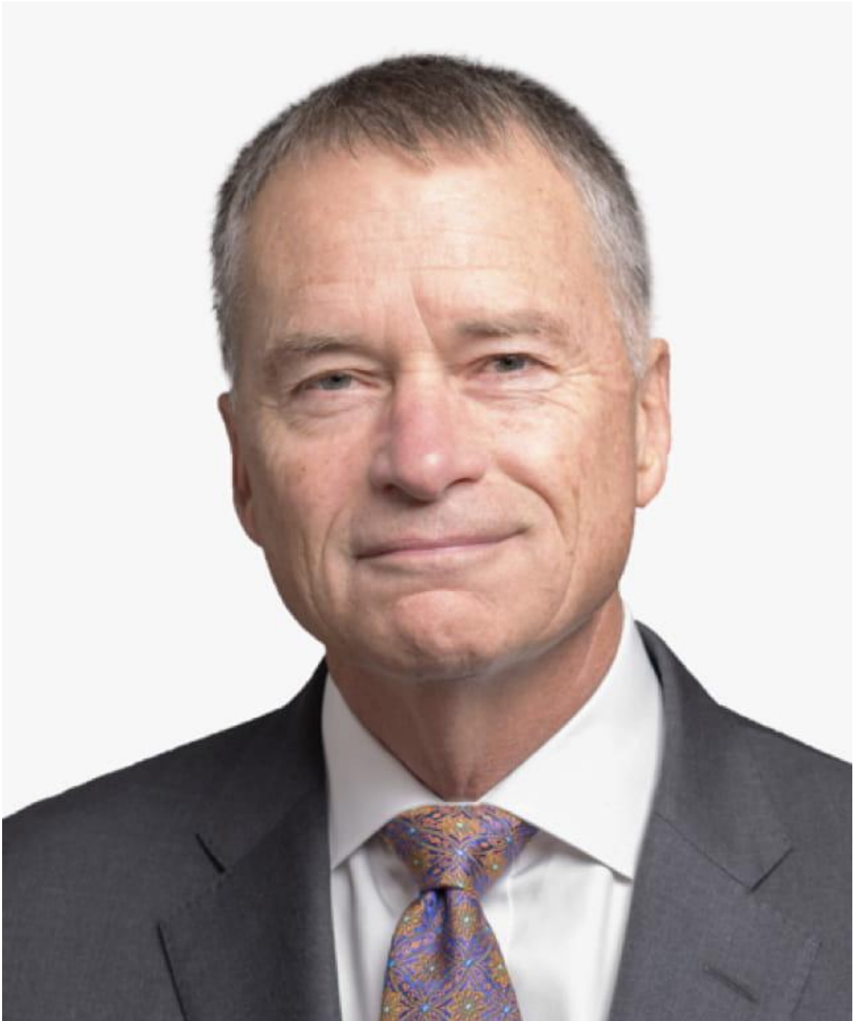
James A. Winnefeld Jr.

Admiral, U.S. Navy (Ret.) and Former Vice Chairman of the Joint Chiefs of Staff