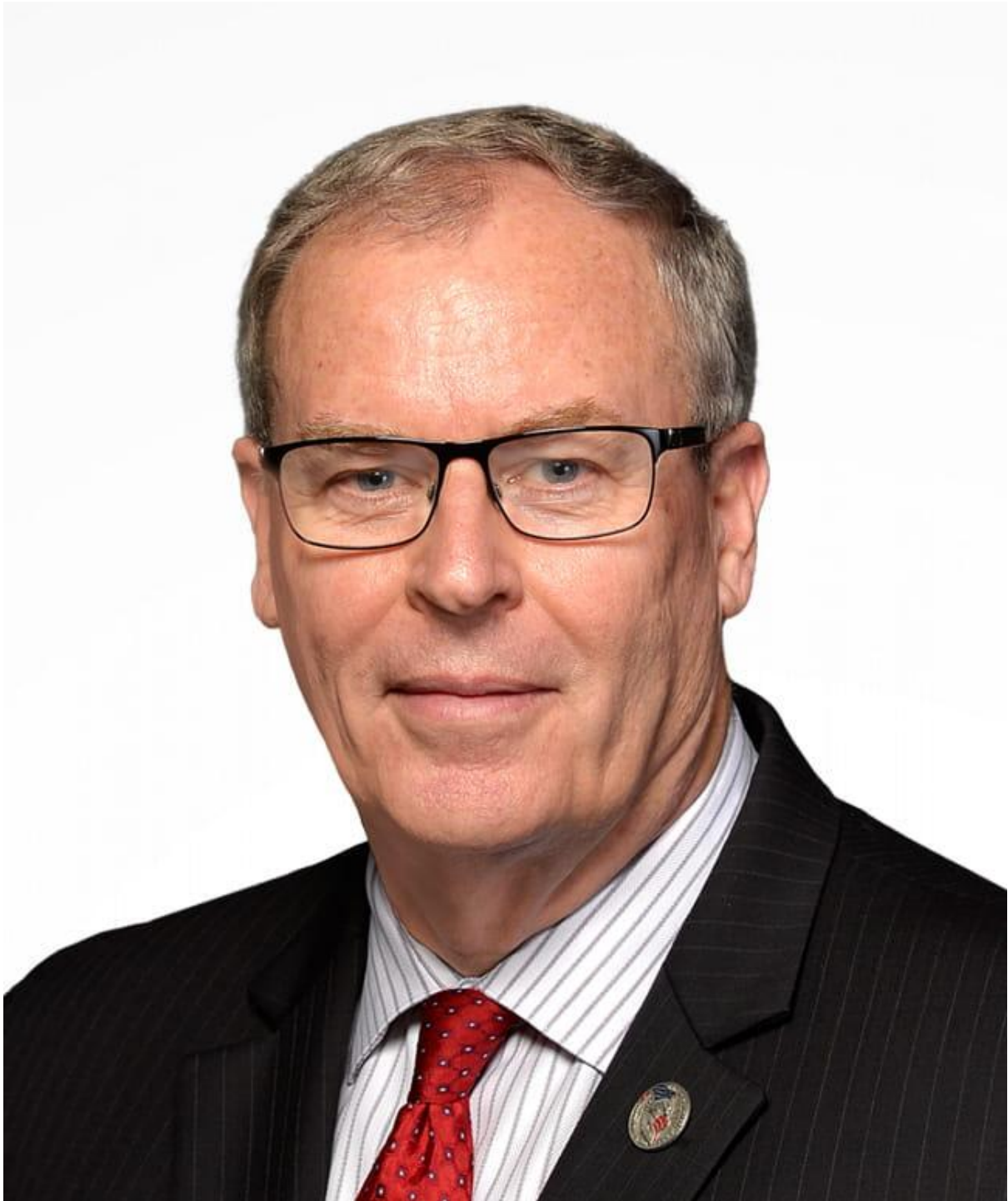
Robert O. Work