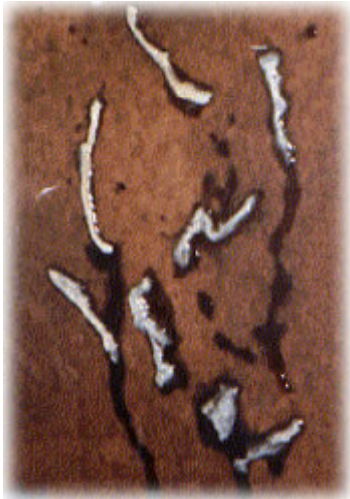
Photograph of worms killed in the first few minutes of zapping during a colonic irrigation treatment

The US Center for Disease Control (CDC) has found that the average American carries a weight of 500g living parasites. Toxins in our food, household chemicals and the environment are weakening the barrier of the colon against penetration by intestinal worms and other parasites.