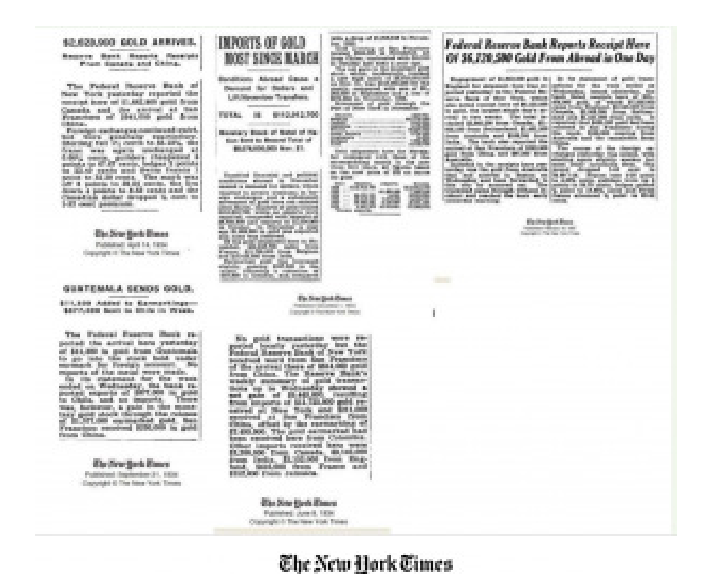
GOLD STOCKS HERE ROSE $1,396,000,000; 1934 Total $8,228,000,000, Is Largest in Weight and Dollar Value in History. DOLLAR UNCERTAINTY EBBS Revaluation and 'International Bullion Standard' Marked Year's Currency Events.

world, one that seems to have been expunged from all our history books, to the point where I doubt one person in a million has any knowledge of it. Like all good frauds, it was simple: From 1932 until the start of World War II, the US government and the Jewish media were extravagantly fear-mongering to the entire world that either Japan or Germany would be invading every nation and inevitably looting all their central and commercial banks. The solution offered was for all the banks in all the world's nations to turn their entire gold reserves over to the US FED for safekeeping until the war was over. And they did. Every day, the New York Times faithfully recorded shipments of millions of dollars of gold from all these nations to the US. One NYT article claimed seven US naval destroyers laden with 125,000 metric tons of Chinese gold sailed to the US in 1938, one of many such. These "deposits" were evidenced by gold certificates issued by the US Treasury, although the gold actually went to the US FED.