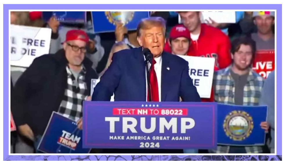
Rev > Blog > Transcripts > 2024 Election > Trump Rally from Durham, New Hampshire 12/16/23 Transcript

Trump Rally from Durham, New Hampshire 12/16/23. Read the transcript here.