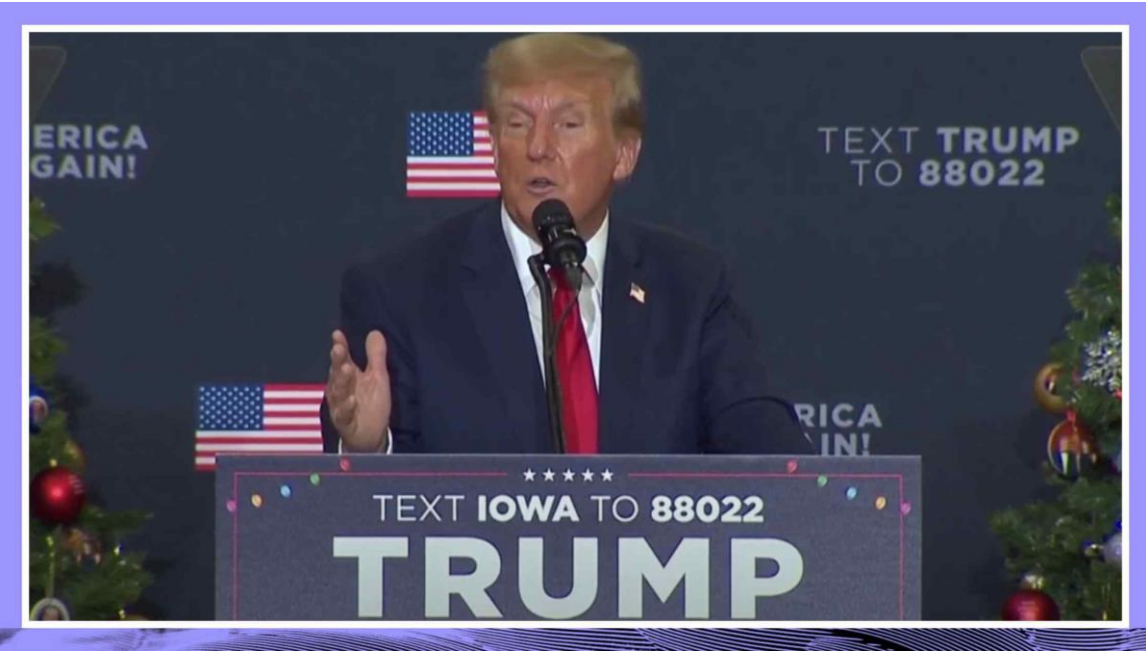
<u>Rev</u> > <u>Blog</u> > <u>Transcripts</u> > <u>14th Amendment</u> > Trump Holds Rally In Iowa Moments After Colorado Supreme Court Blocks Him From Ballot Transcript

Donald Trump holds a campaign rally in Waterloo, Iowa, moments after the Colorado Supreme Court blocked his access to the ballot. Read the transcript here.