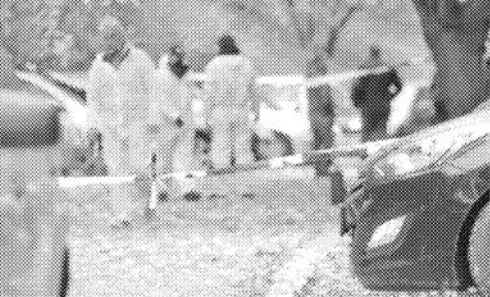
Датум: 24. мај 2017.

Најпре морају да се почисте сви они који сарађују с убицама и криминалцима, рекао је Александар Вучић